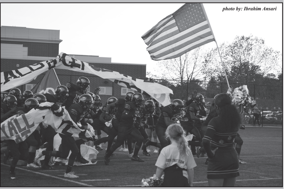
The Panthers improved to 6-1 on the season with a dominant performance against Northwood. They will look to win their sixth straight game as they take on a tough Sherwood team this week.