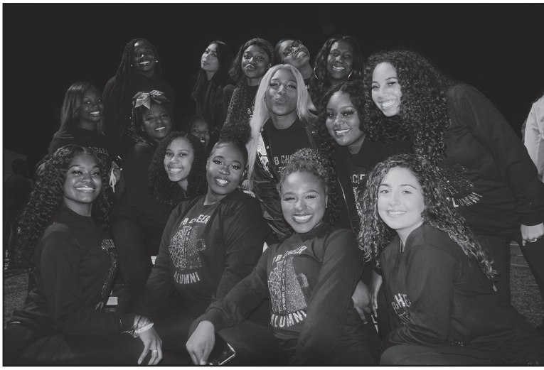
One of the many groups that gathered for the 50th Anniversary event was PB Cheer alums.